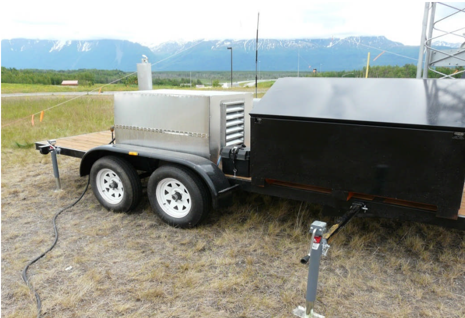
MAKE SURE IS ORIENTED NORTH LEVEL AND ALL OUT RIGGERS OUT AND SECURE