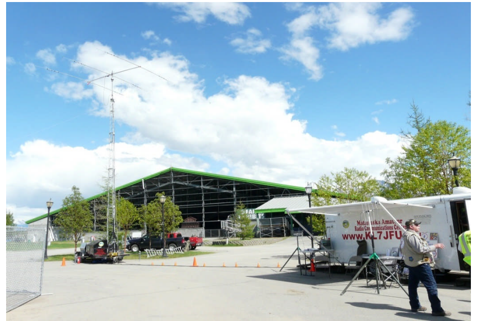
ENSURE SUPPORT TRAILER IS ORIENTED NORTH