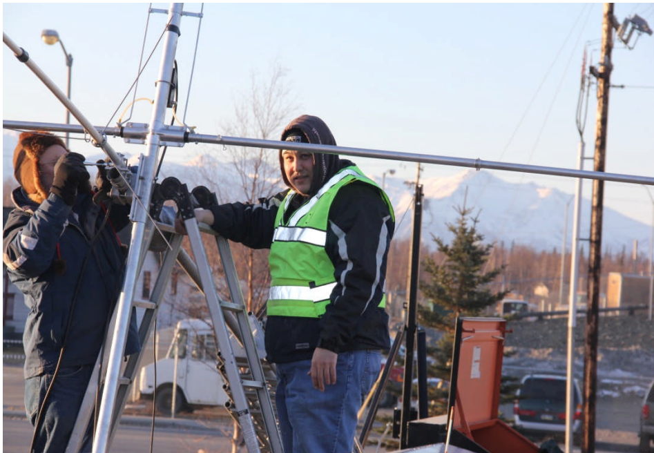
PLACE SPACER NUTS ON ROTOR CLAMP