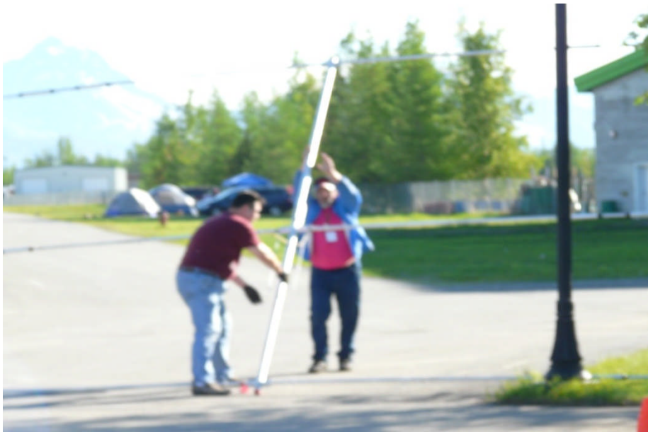
RAISE BEAM WITH DIRECTOR DOWN WITH BACK OF TRAILER ORIENTED NORTH