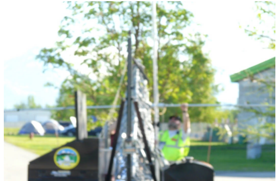
MAKE SURE THE CABLE LOOP IS CORRECT AND SECURE TO TOWER