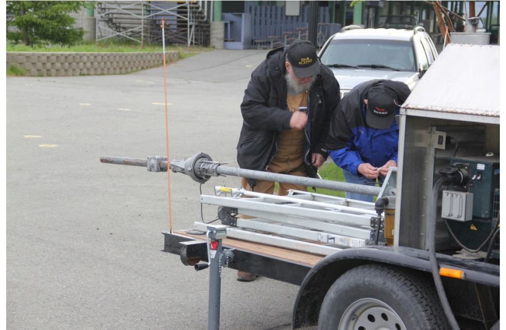
EXTEND MAST AND SECURE & INSTALL ROTOR, ORIENT IT NORTH, INSTALL ROPE ON YARD ARM FOR G5RV