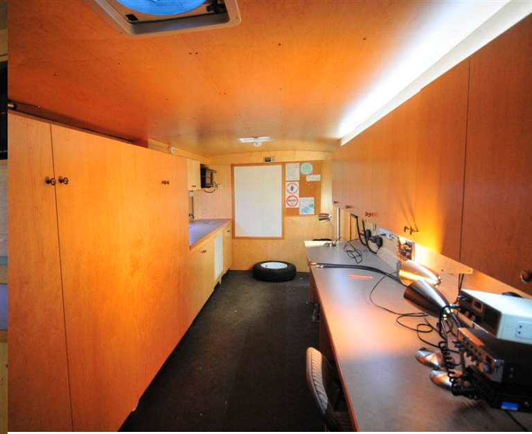
Before Setup and what we should have after tear down, securing all lights and AC power