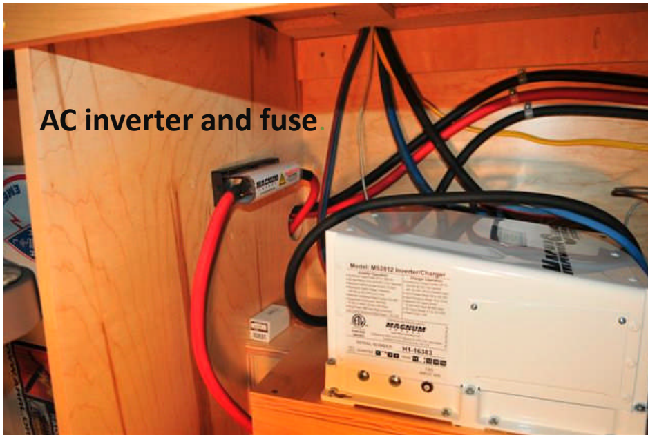
AC inverter and fuse