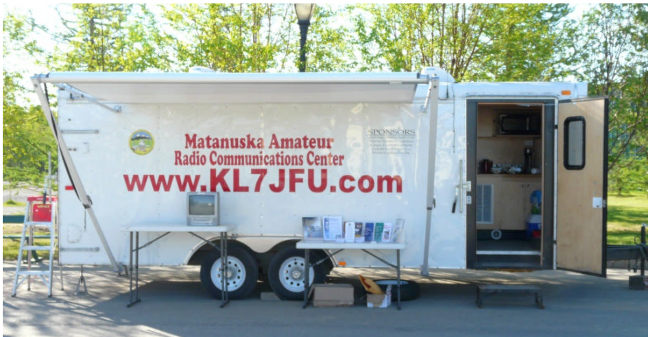
Deploy Awning & tables as needed