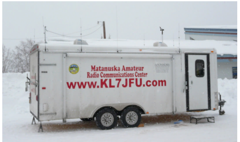
Unlock rear door ramp & install rear jacks