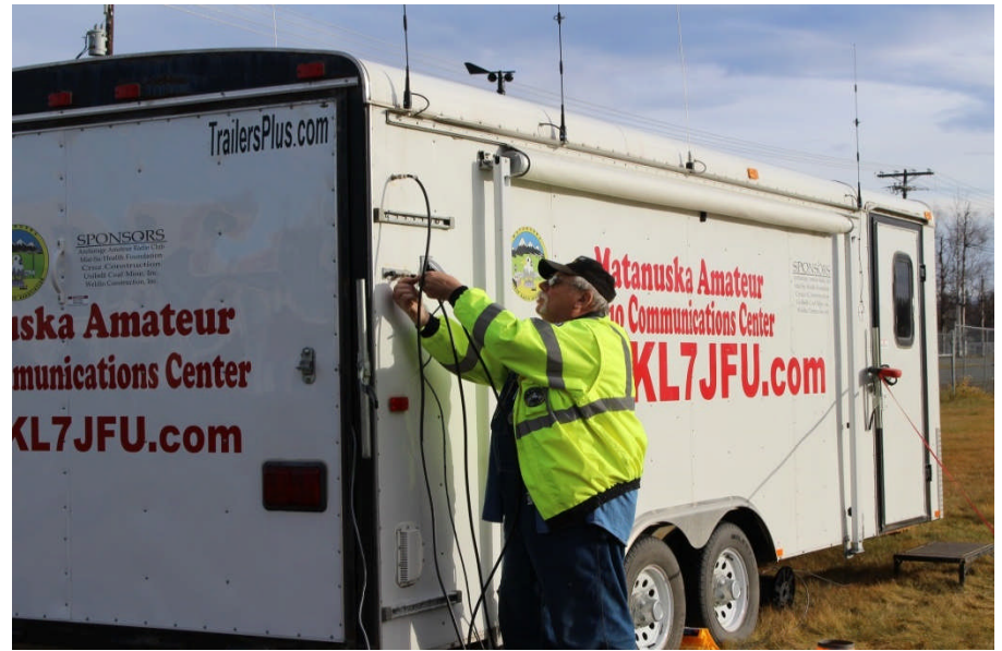
Install Coax & Rotor control cables on thru/jacks